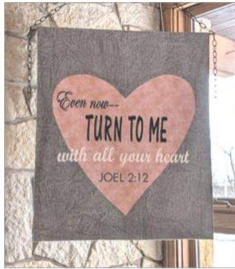
New banner for Lent (& anytime)